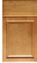
Huntington Natural (Upgrade)