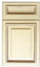
Richmond Ivory (Upgrade)