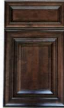
Andover Merlot (Upgrade)