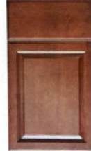
Huntington Brandy (Upgrade)