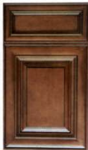
Andover Cinnamon (Upgrade)