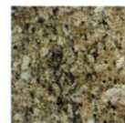
New Venetian Gold